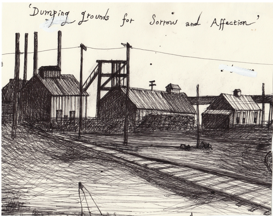
John Tottenham, Dumping Grounds for Sorrow and Affection, 2014, ink on paper, 10 x 8 inches

2680 South La Cienega Blvd., Los Angeles, CA 90034 1310.570.6420