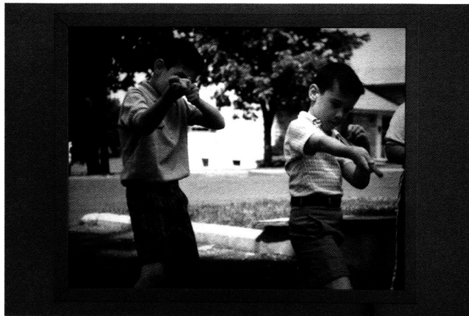
Some People exhibition, Maloney Fine Art, Los Angeles, April 27 to June 1, 2013.